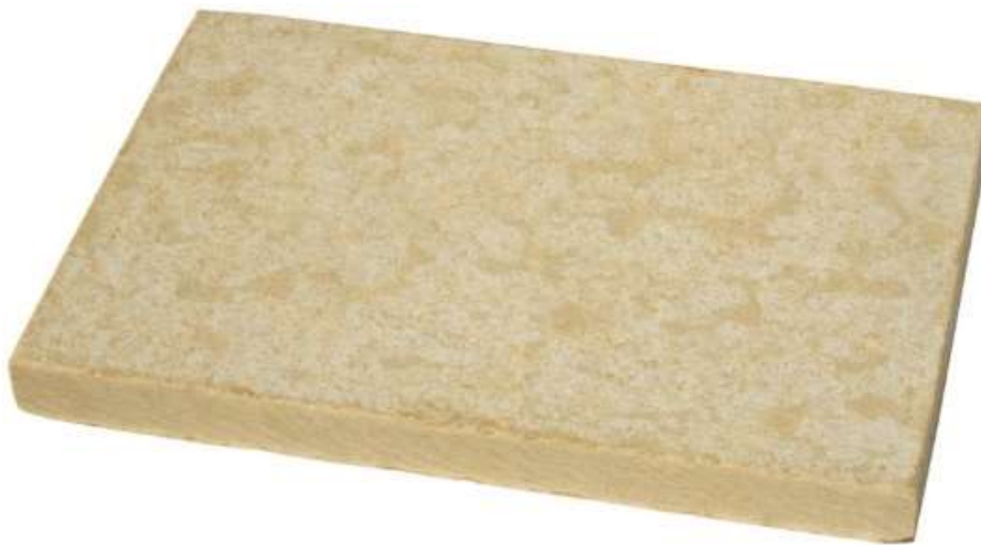
Typical Y-Wall board